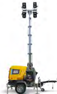
DIESEL POWERED LIGHTING TOWER

These units are portable and can be easily moved to different locations as needed, making them highly flexible and adaptable.