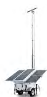
SOLAR POWERED LIGHTING TOWER

These units offer high-performance lighting, and instant power, making them perfect for demanding work sites and emergency situations.