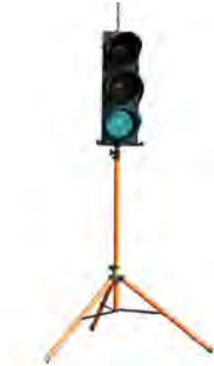
PTCD | PORTABLE TRAFFIC CONTROL DEVICES

Our traffic lights have three different operation modes, manual, automatic, and vehicle detection.