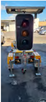
PORTABLE TRAFFIC LIGHTS

Our traffic lights have three different operation modes, manual, automatic, and vehicle detection.